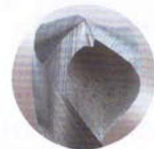
Left hand twist drill bits

Optional SD Grinding Wheel for Carbide Drills