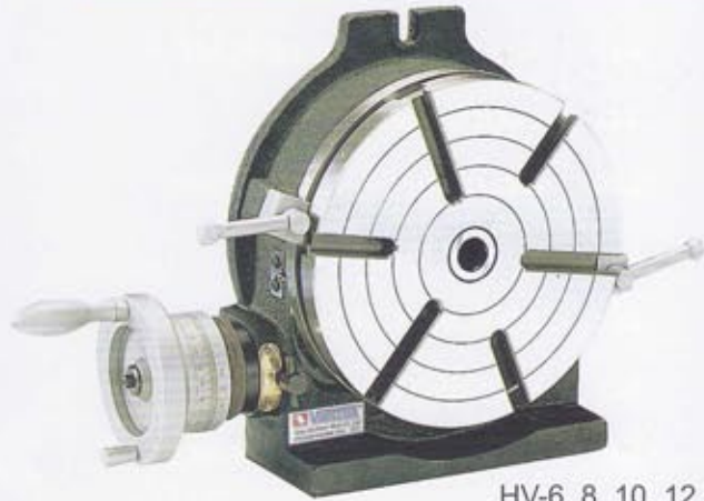
HV-6, 8, 10, 12, 14, 16