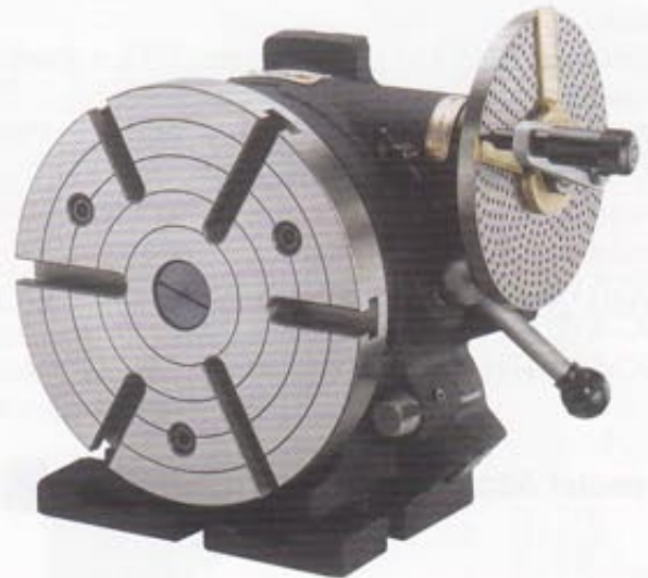
The state of CS-8 fitted with Face Plate & Dividing Plate